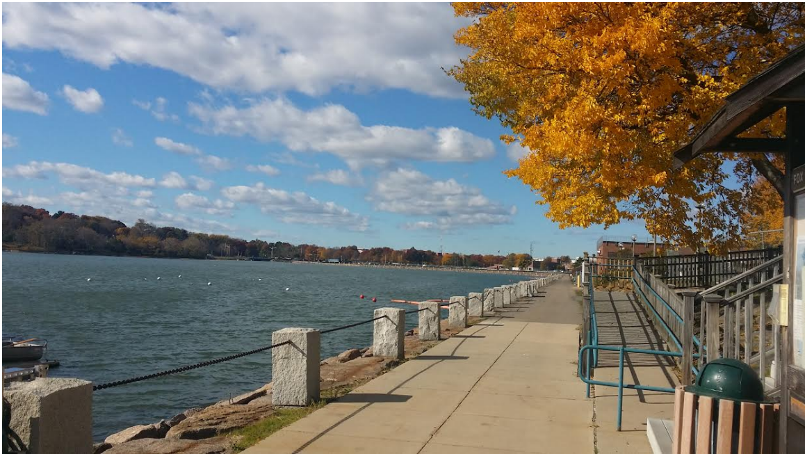
UMass Boston Harbor walk in Fall (October)