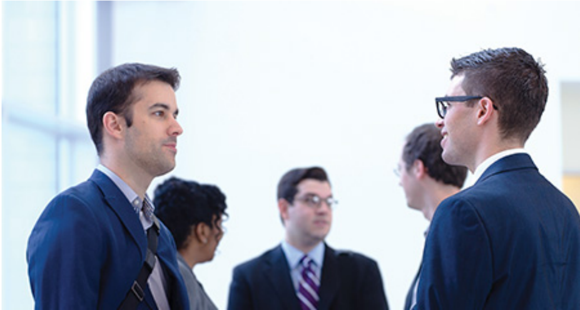
International exchange students who came to study at UMass Boston as exchange students from Europe and returned to get their MBA afterwards (2014).